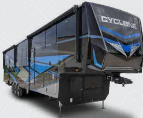
Featuring: Blue Paint Option

For more information and to take a virtual walk-through, visit www.heartlandrvs.com